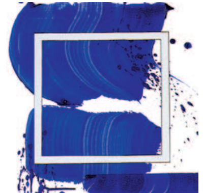
Rudolph Rainer metarationality, 1997 tecnica mista 60x60